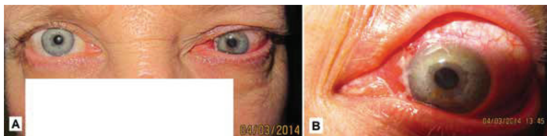
Fig. 2 Clinical picture of the same patient in March 2014 – progression with tendency of infiltration into orbit