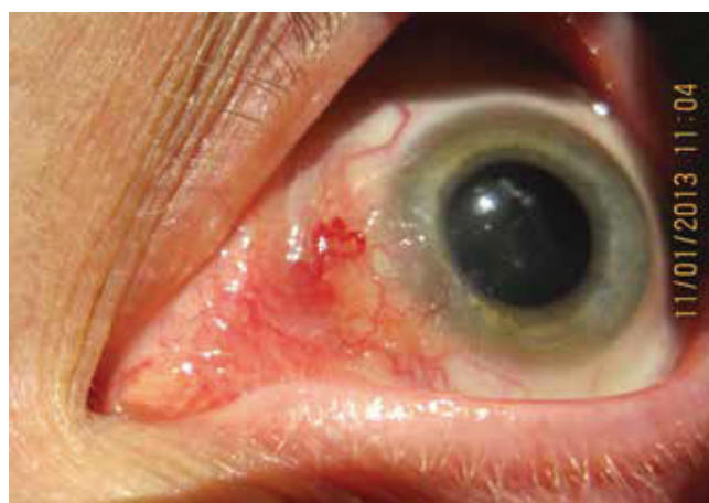
Fig. 1: Clinical picture of a patient with inverted type of conjunctival papilloma in the nasal section of the bulbar conjunctiva (1/2013)

The prevalence of conjunctival papillomas depends on geographical region, but in general it is higher than the prevalence of conjunctival carcinomas. There is a higher incidence in individuals of Caucasian race, male sex, and people aged between 50 and 75 years. In our cohort the highest incidence of lesions was in patients aged between 60 and 70 years, which is in accordance with the available publications. In our cohort we also recorded a higher