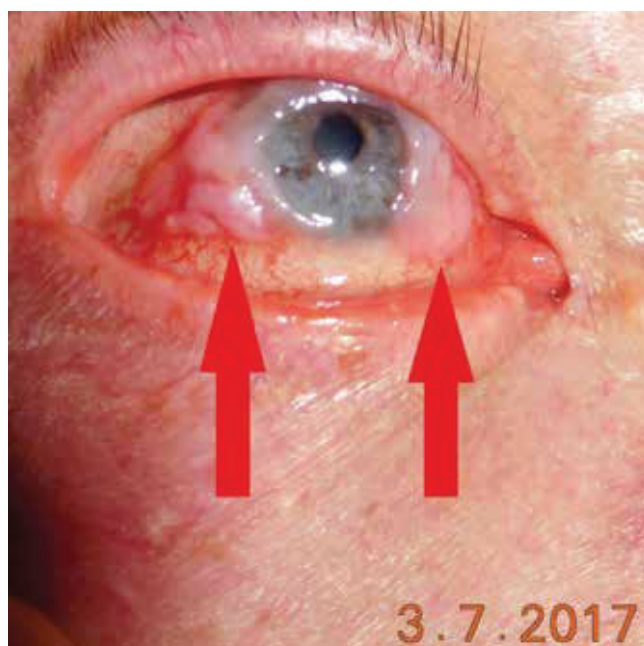
Fig. 6: Clinical picture of a patient with squamous cell carcinoma of bulbar conjunctiva