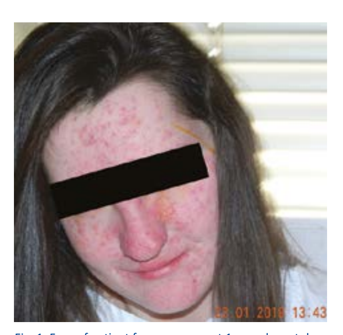
Fig. 1. Face of patient from case report 1, papulopustules with crust visible on face

anti-inflammatory therapy was set for the patient with Azitromycin 500 mg 1x per day within a regimen of three--day use, with a subsequent four-day pause, repeatedly with local use of Soolantra cream 10 mg/g on the skin (ivermectin) 2x per day. Of local therapy Floxal (ofloxacin 3 mg gtt.) with Dexamethasone gtt. was applied 5x per day into both eyes, together with artificial tears in the same regimen and Opatanol (olopatadine 1 mg gtt.) 2x per day due to subjective complaints of the patient in the form of itching and increased photophobia. After eight days of hospitalisation, we discharged the patient with the same BCVA as upon admittance in both eyes. The finding on the anterior segment of both eyes was markedly improved - injection of the conjunctiva had regressed and we recorded a reduction of the surface and number of corneal infiltrates. The patient reported to the general outpatient section for a follow-up examination 3 weeks