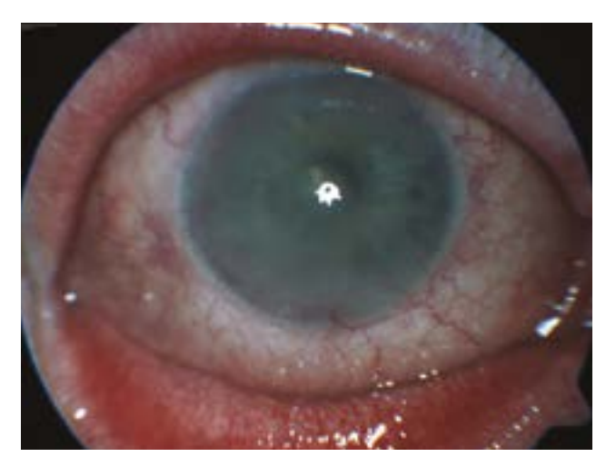
Fig. 5. Right eye of patient from case report 2 with mixed injection of conjunctiva, semitransparent cornea and peripheral limbal superficial and deep corneal vascularisation

nea semitransparent, uneven surface, pronounced superficial and deep circular corneal neovascularisation by limbus, more in right eye (Fig. 5), intraocular finding physiological. The patient was hospitalised at our department with a diagnosis of keratoconjunctivitis bilaterally upon a background of general pathology of rosacea. Doxyhexal 200 mg (doxycyclin tablet) was administered 1x per day generally, with local application of Maxitrol gtt. (dexamethasone, Neomycin, Polymyxin-B) to both eyes every 2 hours, with rinsing with 5% Betadine solution. During hospitalisation a higher value of intraocular pressure was identified by chance in the patient in both eyes, which was well compensated by local antiglaucomatous therapy Simbrinza gtt. (combination of carboanhydrase inhibitor and selective alpha2 receptor agonist), Xalacom gtt. (combination of selective prostanoid FP receptor agonist with prostaglandin and non-selective beta-andrenergic receptor blocker). After 10 days of hospitalisation the patient was discharged with a slightly improved finding in the anterior segment and compensated