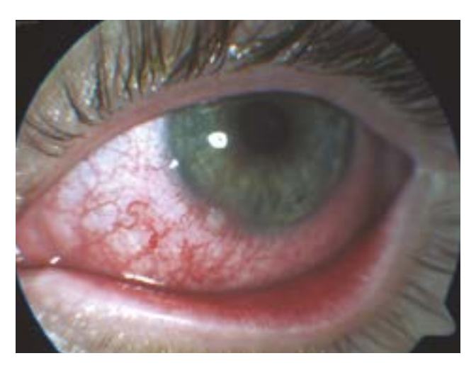
Fig. 3. Right eye of patient from case report 1, mixed injection of conjunctiva with incipient corneal ulcer by no. 7

after discharge with a deterioration of vision in the right eye to a value of 6/60 and with slight worsening of the ocular finding. The worsening of the patient's condition was influenced to a certain degree by poor co-operation of the patient in her treatment. After repeated follow-up examinations with a gradual improvement of BCVA, we then retained treatment for the patient of Floxal ung. 2x per day applied to right and left eyes, Flucon (Fluometholone) gtt. to right eye 5x and left eye 3x per day, Optaonol gtt. 2x per day to right and left eye, Ikervis gtt (Cyclosporine) at night to right and left eye [2]. The patient remains on general antibiotic therapy in the same dose. At the last follow-up examination at our outpatient department the patient had BCVA of LE 6/7.5, RE 6/30, and also stated that she was in the 3rd month of pregnancy. Finding on anterior segment of both eyes: conjunctiva with superficial injection, cornea of right eye with vascular proliferation from the periphery with numerous maculas and nubeculas. Bilaterally the corneas manifest spotted colouring with fluorescein. Otherwise the finding was within the norm. Subsequently, due to the increased potential risk for the foetus (even despite exclusion of the teratogenic effects according to the sum of data on the pharmaceutical agent - SPC) we discontinued therapy with general antibiotics, Ikervis gtt., Floxal gtt, and we are continuing to observe the patient.