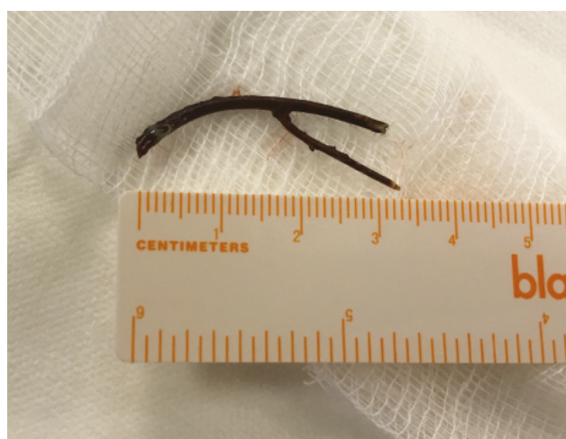
Fig. 4b. Extracted twig from anterior part of orbit

whether the eyeball and optic nerve are damaged or threatened. Penetrating injury of the eyeball must be unequivocally excluded. If the patient's condition so allows, we must examine visual acuity and the ocular fundus.