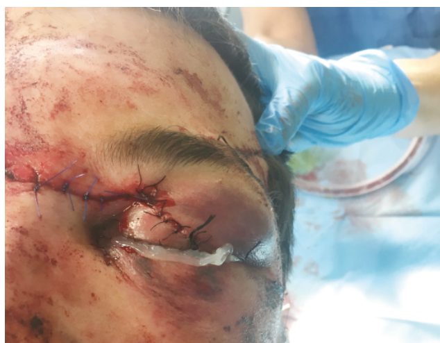
Fig. 5b. Condition immediately after reconstruction of the eyelid by an ophthalmologist