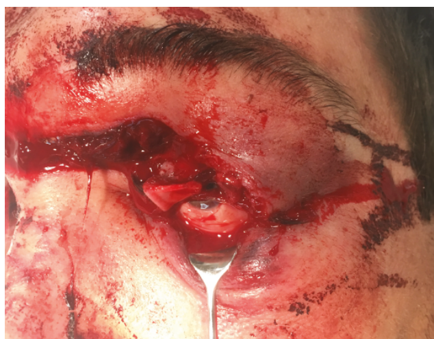
Fig. 5a. Industrial injury by saw. The wound on the upper eyelid is deep enough to cause damage to the musculus levator palpebrae superioris

Minor superficial injuries to the eyelids can be resolved conservatively, with the application of antibiotic cream.