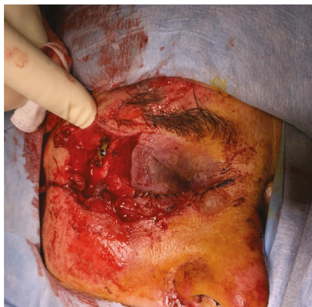
Fig. 6a. Severe injury to orbit and eyelids in traffic accident. Performed reconstruction of the fracture of the outer wall of the orbit by a stomatosurgeon is visible