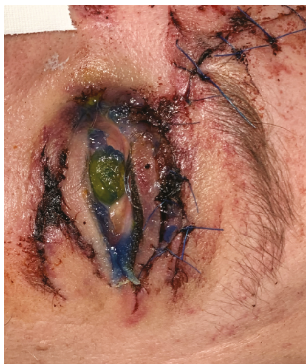
Fig. 8. Photograph shows a rarer complication of oculoplastic traumas – patient after injury (traffic accident) – probably loss injury of upper eyelid following primary reconstruction – with a finding of exposure keratitis with lagophthalmos upon a background of inability to close ocular aperture

This is a relatively rare but serious sight-threatening complication. It represents an urgent condition in which