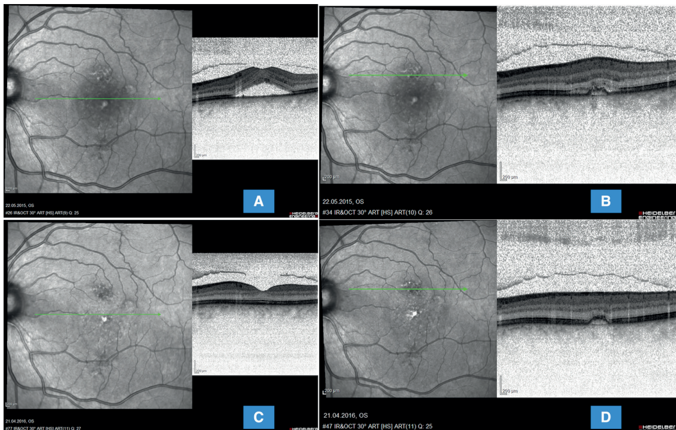
Fig. 2. Optical coherence tomography of same patient (HRA-OCT Spectralis Heidelberg). (A) shows a transfoveal linear scan of high serous detachment of neuroretina with already dystrophically altered photoreceptors (but relatively well preserved individual retinal layers). (B) shows a transretinal linear scan of an active leaking lesion of undulating retinal pigment epithelium with mild exudative activity before performing reduced photodynamic therapy. (C) 1 year after performing reduced photodynamic therapy the image shows complete absorption of subretinal fluid, restoration of interdigitation zone and distinct regular retinal pigment epithelium subfoveolarly and (D) irregular undulating retinal pigment layer remains in place of original active lesion without signs of activity

we irradiated multiple active areas with 2 laser spots in one session. In 43 eyes (79.6 %) we achieved complete resorption of SRT after the actual performance of HD-PDT (Fig. 2 C,D). We recorded incomplete resorption of SRT in the remaining 11 eyes (20.4 %), in which after a time interval additional therapy was chosen, specifically the application of an anti-VEGF injection into the vitreous space in 7 cases, in 1 eye HD-PDT was repeated after an interval of 3 and more months, and in 3 cases a combined approach was chosen, namely repetition of HD-PDT after an interval of 3 and more months with application of an anti-VEGF into the vitreous space. At the end of the observation period, we achieved a satisfactory result without exudative activity in 49 eyes (90.7 %).