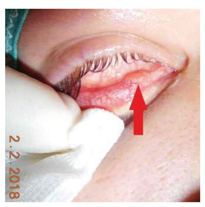
Fig. 3 Clinical picture of a patient with papilloma of conjunctiva on the inner side of lower eyelid