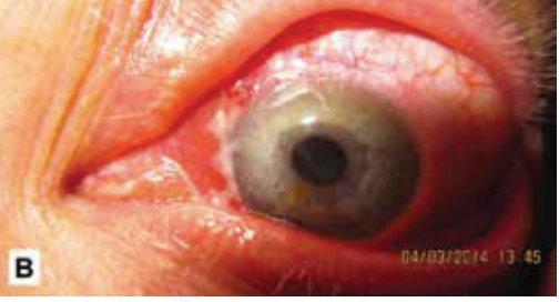
Fig. 2 Clinical picture of the same patient in March 2014 – progression with tendency of infiltration into orbit