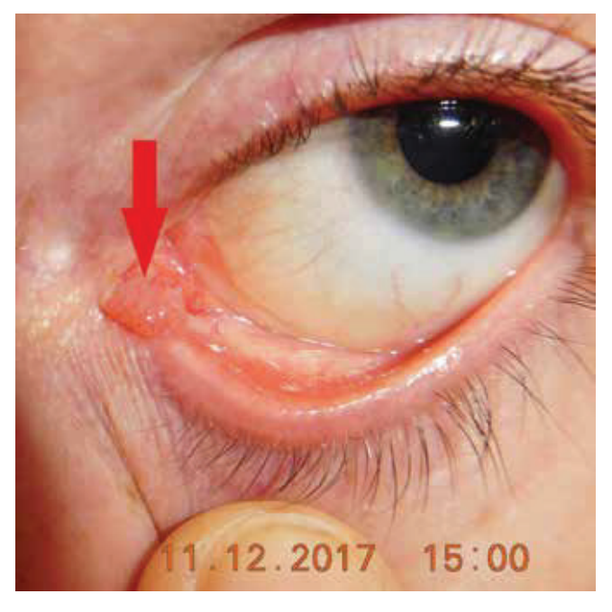
Fig. 4: Clinical picture of a patient with papilloma of caruncula