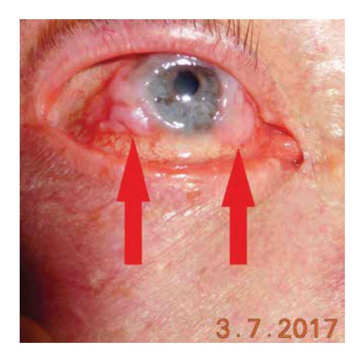
Fig. 6: Clinical picture of a patient with squamous cell carcinoma of bulbar conjunctiva

In this study we focused also on the degree of repeated occurrence of conjunctival lesions after their excision. We confirm the level of recurrence stated in the professional literature – e.g. in the study by Sjö et al. (16), in a cohort of 165 patients the frequency of HPV was 81%, Eng et al. (2) in a cohort of 24 patients recorded HPV positivity in 58%, Sjö et al. (17) in a cohort of 55 patients recorded positivity in 92%, Nakamura et al. (14) in a cohort of 9