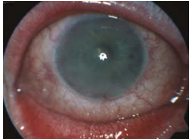
Fig. 5. Right eye of patient from case report 2 with mixed injection of conjunctiva, semitransparent cornea and peripheral limbal superficial and deep corneal vascularisation

A seventy two year old woman was sent to our centre by a local ophthalmologist due to bilateral keratitis upon a background of general pathology of rosacea, for which she had been receiving treatment since 2016. She stated deterioration of vision over the course of approx. 3 weeks, lachrymation and reddening of the eyes. BCVA in the right eye was 1.5/60, in the left eye 0.3/60. Actinic keratosis was visible on the face (Fig. 4). The following finding on the anterior segment was recorded bilaterally: conjunctiva with mixed injection, seropurulent secretion and follicular reaction, cor-