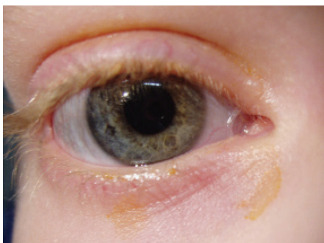
Fig. 2 Bicanalicular Intubation of right eye, silicone cannula between the lacrimal points.

test was used for comparison of the average age in MI and BI. Evaluation of the therapeutic effect of MI and BI 6 months after intubation was performed using a Pearson's chi-squared test for two selections, and if the condition for its use was not met the results were processed using a Fisher's exact test. The statistical tests were evaluated on a level of significance of 5 %.