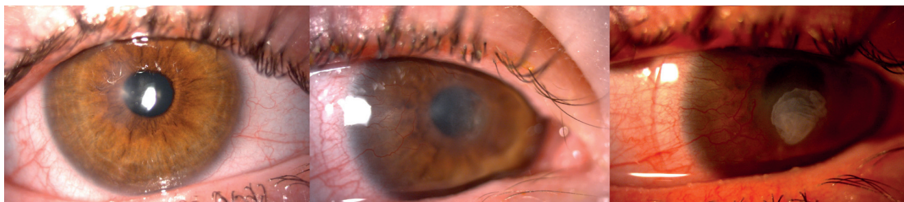
Figure 1. Slit lamp images of the right eye. Paracentral corneal opacity without inflammation was present in the inactive phase of the disease after several inflammatory episodes (left). Temporal superficial stromal vascularization and central infiltrates with perforation in the active inflammatory phase (middle). One week after surgery, amniotic graft and bandage contact lens was in place (right)

ficial stromal vascularization when active phase of the disease was present (Figure 1). The patients' subjective symptoms (fluctuating bilateral eye redness) started in March 2020, however, she sought medical attention only after 9 months from the onset. At the first ophthalmic evaluation, right eye was inflamed showing conjunctival injection, and multiple small non-staining corneal infiltrates. Paracentral stromal scarring of the left cornea was already present. Between November 2020 and August 2024, altogether 50 follow-ups took place at our